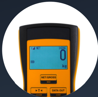
Large Display on remote control