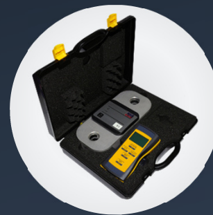
Handy transport case